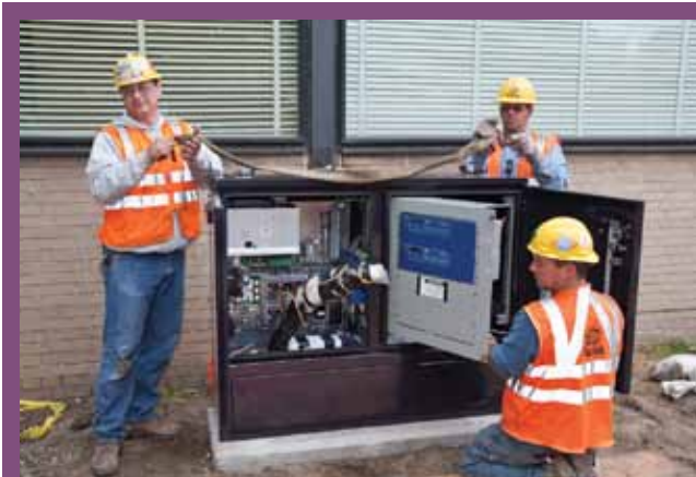
Installation of S&C Remote Supervisory Vista Underground Distribution Switchgear for High-Speed Fault-Clearing System.