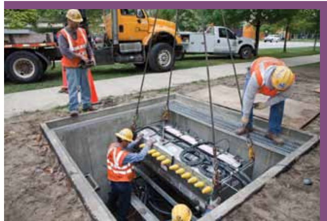
Installation of S&C UnderCover™ Style Vista Underground Distribution Switchgear.